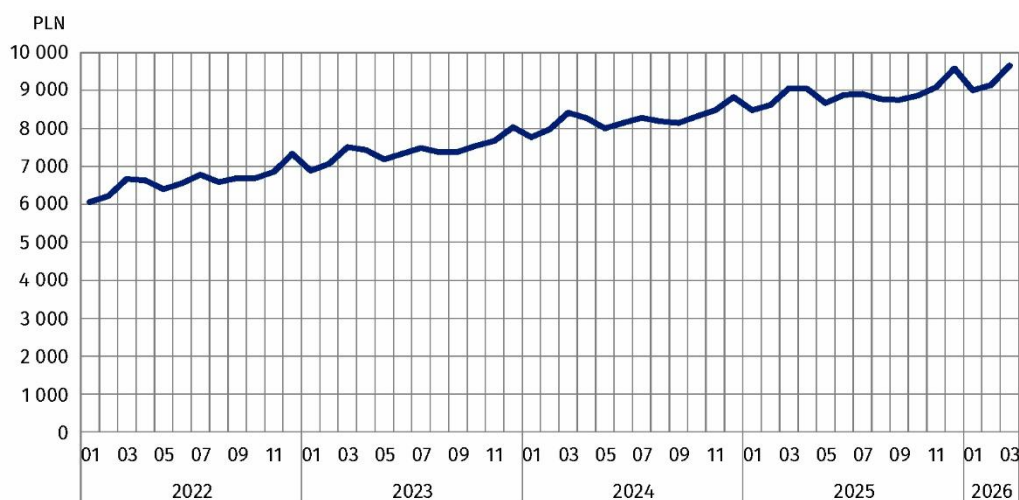
Chart 2. Average monthly gross wage and salary in the enterprise sector

The average monthly gross wage and salary in the enterprise sector includes the basic wage and salary and additional components of wages and salaries, including bonuses, awards, overtime pay and retirement severance pays